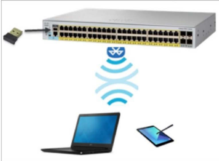
Figure 2. Over-the-air switch access using Bluetooth