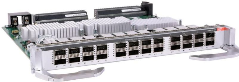
Figure 1. Cisco Catalyst 9600 Series 24-Port 40GE/12-Port 100GE Line Card (C9600-LC-24C)