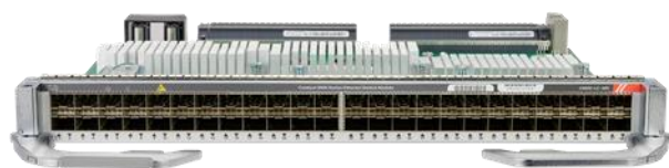
Figure 3. Cisco Catalyst 9600 Series 48-Port 1GE line card (C9600-LC-48S)