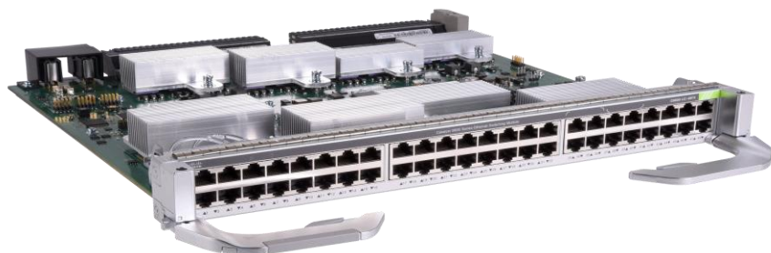
Figure 4. Cisco Catalyst 9600 48-port RJ45 Copper - 10GE/5GE/2.5GE/1GE/100Mbps/10Mbps Line Card (C9600-LC-48TX)