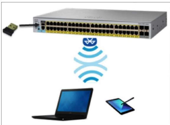
Figure 2. Over-the-air switch access using Bluetooth